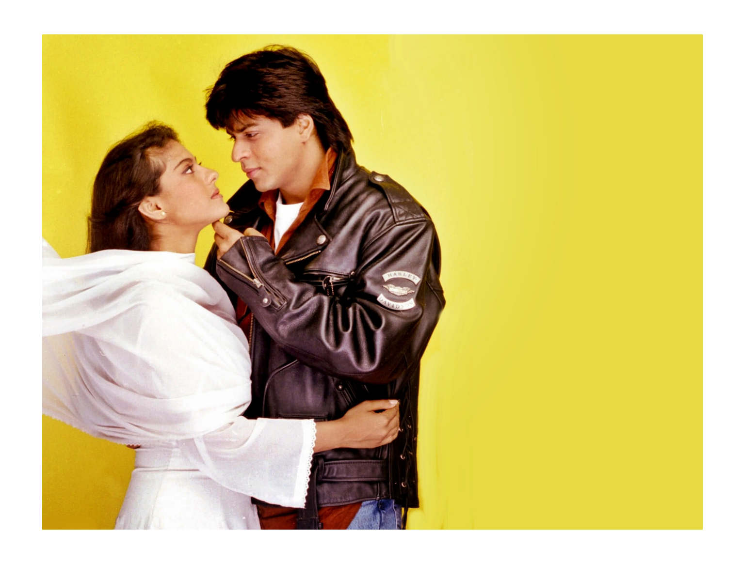
<u>Dilwale Dulhania Le Jayenge 1995 Hindi Br Rip 720p 500mb-12</u>